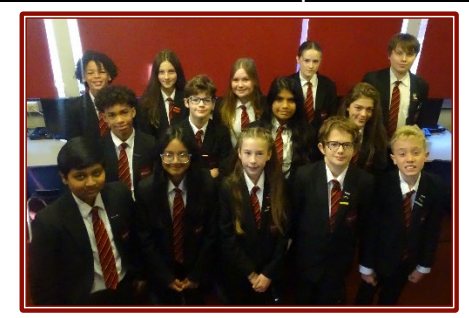
Year 9 Form Captains