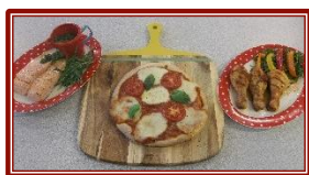
Evie A. (10K)

As part of their GCSE Food and Nutrition course, Year 10 pupils had to complete a 3 hour mock exam. They had to produce three dishes in three hours, showing a variety of skills. They could pick from three tasks either designing a menu for a vegetarian, a Mediterranean menu or a menu high in fibre for teenagers. Below are some examples of the meals produced.